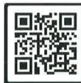
Capital Campaign Website