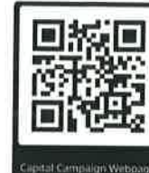
Capital Campaign Website

Heavenly Father, By your Divine Will and Providence, you established our parish under the patronage of St. Patrick 150 years ago. Throughout these years you have provided for and guided our parish with your Grace in every moment of need. With confidence we call upon your Divine Assistance once again, to guide us and lead us, to give us generous hearts open to Your Will, as we work to repair our Church. So that through our efforts and your Grace we may preserve our heritage, strengthen our faith, and our future, providing a holy place for generations to come to encounter and grow in the faith and love of Jesus Christ. We ask this, and all things, through Christ our Lord. Amen.