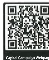
Capital Campaign Webpage

St. Patrick parish family, grounded and united in our love of Jesus Christ, seeks to Know, Love, and Serve God through prayer, education, worship at the Holy Mass, hospitality, stewardship, and evangelization of our community.