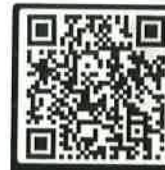
Capital Campaign Webpage

Heavenly Father, By your Divine Will and Providence, you established our parish under the patronage of St. Patrick 150 years ago. Throughout these years you have provided for and guided our parish with your Grace in every moment of need. With confidence we call upon your Divine Assistance once again, to guide us and lead us, to give us generous hearts open to Your Will, as we work to repair our Church, So that through our efforts and your Grace we may preserve our heritage, strengthen our faith, and our future, providing a holy place for generations to come to encounter and grow in the faith and love of Jesus Christ. We ask this, and all things, through Christ our Lord. Amen.