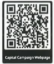
Capital Campaign Webpage

St. Patrick parish family, grounded and united in our love of Jesus Christ, seeks to Know, Love, and Serve God through prayer, education, worship at the Holy Mass, hospitality, stewardship, and evangelization of our community.